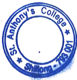
Principal St. Anthony's College Shillong - 793001 Meghalaya - India

I hereby declare that the details and information given above are complete and true to the best of my knowledge and belief.