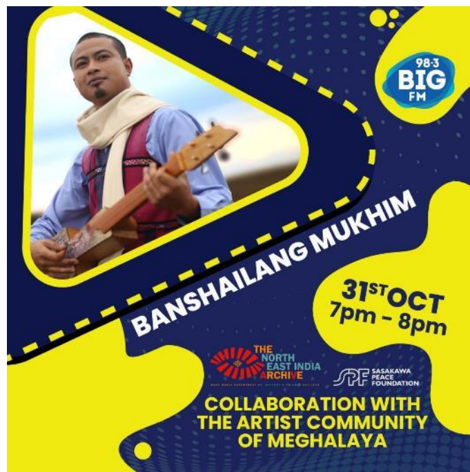
Social Media Post on Big FM 98.3 Northeast

The works of the artists were featured in Big Fm Radio Stations and Meghalaya Times Newspapers. More effort is being made to get works of the artist featured in other media platforms.