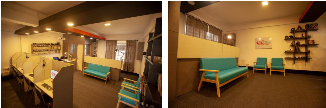
The Northeast India AV Archive office with offline access cubicles