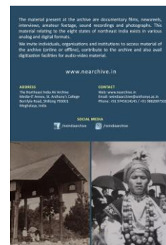
The Northeast India AV Archive kiosk and flyer design