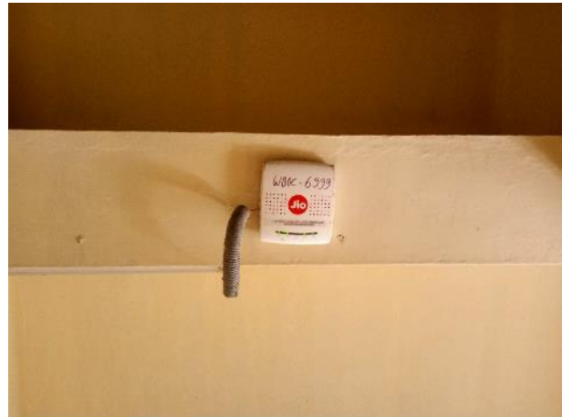
Reliance JIO access points located at various places in the campus for Wi-Fi

Safety and Security: The college campus is under continuous security surveillances using CCTV cameras placed at different locations. The CCTV camera are working 24x7 such that the security and safety of the staff, students and the equipment in various labs are monitored.