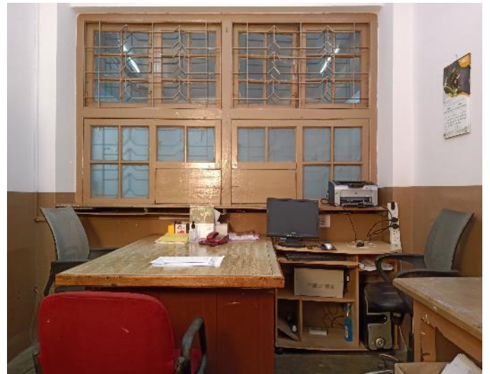
IT Facilities in College Offices ( View )

Besides, the college also uses licensed Microsoft Windows (desktop and server) operating systems, MS-Office, MS-Teams and other development applications along with academic licenses of Adobe Master Collection, Oracle databases, Sibelius Music software, Tally, Zoom, Orell Language lab software, etc. which are renewed annually.