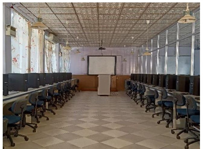
ICT facilities in Laboratories ( View )