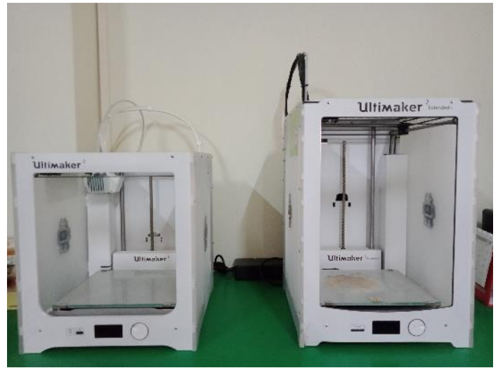
Mac machines and 3-D printers at DIC Lab ( View )