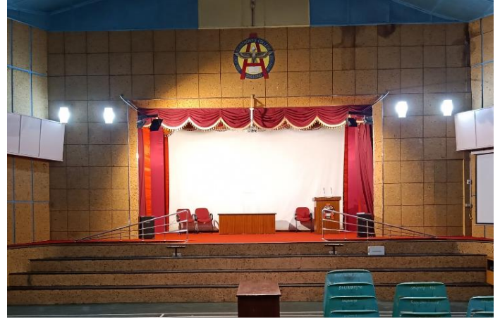
IT facilities in Conference Hall and Auditorium ( View )