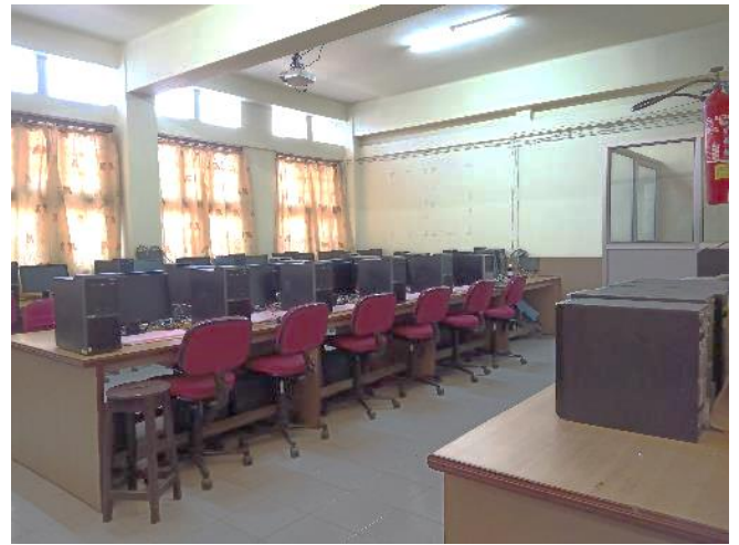
ICT facilities at Bioinformatics Centre ( View )