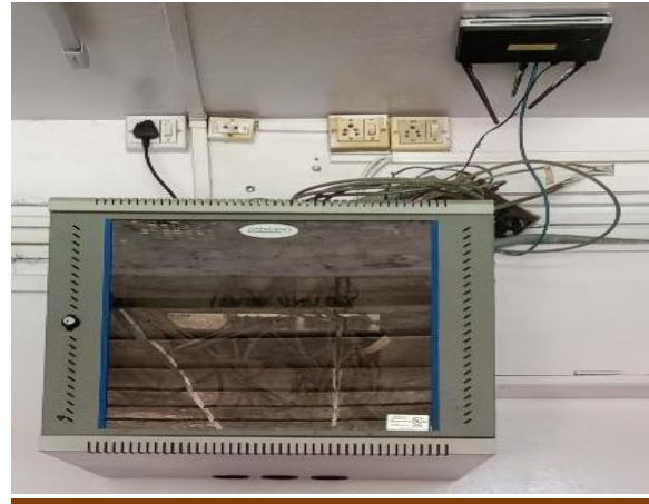
IT infrastructure at Server room and other locations ( View )

Macintosh machines are installed in the Design and Innovation (DIC) Lab along with two 3-D printers; to be used by the students for their innovative modeling and designing works.