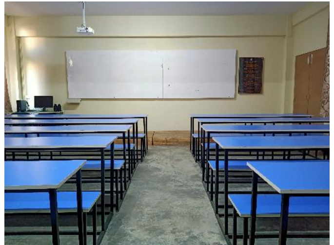
ICT facilities in Classrooms ( View )