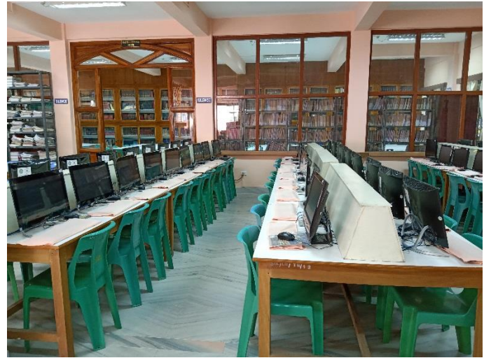
IT Facilities at College Central Library ( View )