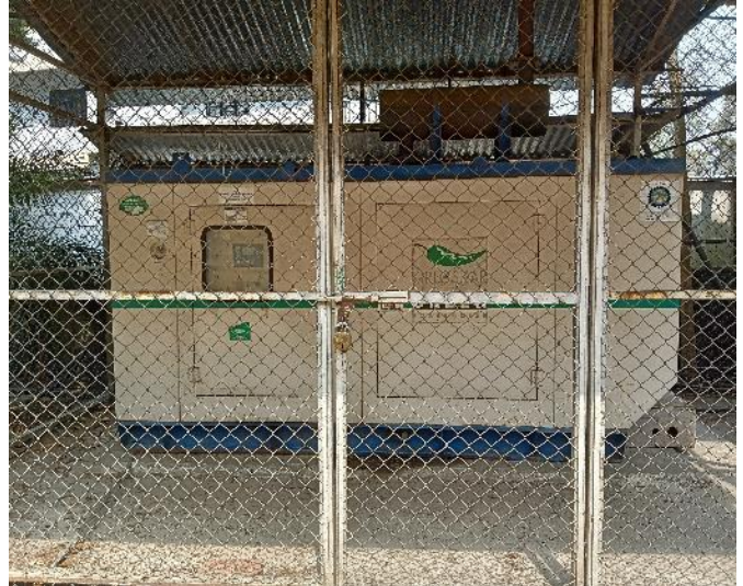
Generators installed in the college