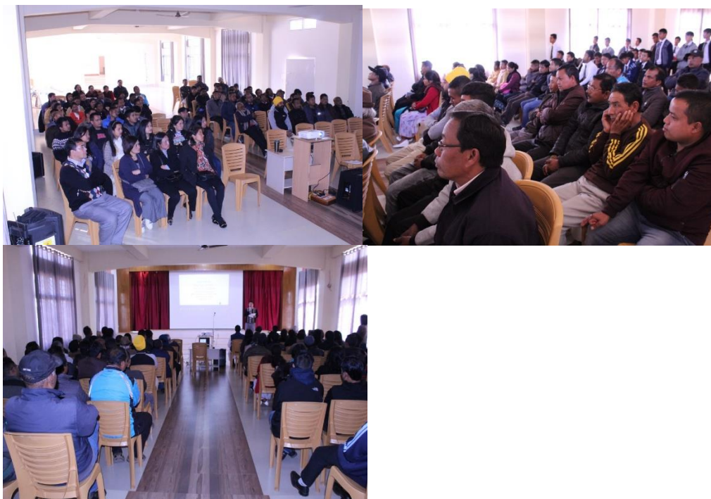
Snippets from the Programme

The programme ended with a vote of thanks from one of the participants and then singing of the National Anthem. Lunch was served at the end of the session.