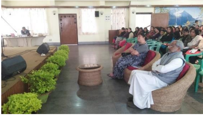
Top : A section of the participants during the programme