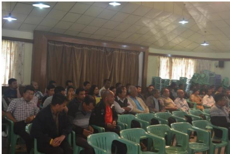
A candid moment from the programme Outbound Leadership Training

The programme began with a short prayer. The resource person welcomed the participants. He animated a lively session. The Resource Person delivered a very relevant talk on leadership. The session was also activity based where the participants were asked to do certain task in order to learn the different trends of leading with positive attitude and positive motivation. The session ended with a vote of thanks from one of the non-teaching staff. the session ended with high tea.