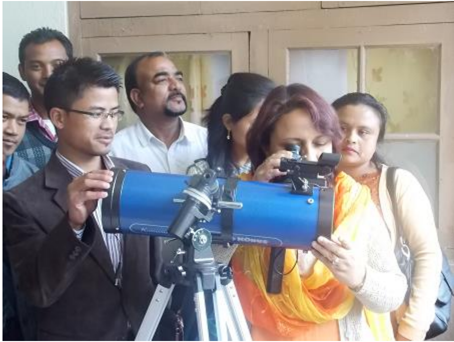
Observational and awareness drives