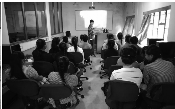
During the class session of Basic IT Course with Participants from Savio Evening School

Such programmes help not only the participants who undertake these courses, but also help in boosting the confidence of the Club members especially with regards to public speaking and they also stand to gain from the experience of organizing these kinds of programmes.