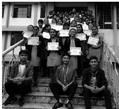
Participants from Savio Evening School

The second programme conducted was a course titled 'Basic IT Course' for students from Savio Evening School. Twenty five students participated in this course which was taught by the 3rd Semester B.Sc. Computer Science students. The course was held in the College from 23rd July, 2018 to 31st July, 2018. The aim of this programme was to impart basic knowledge of computers and Microsoft Office.