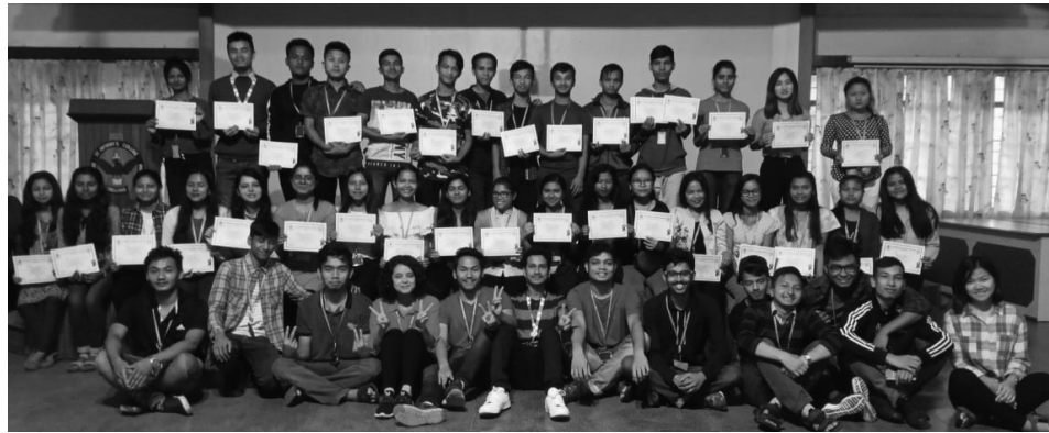
Certificate Distribution for Basic IT Course

The first programme conducted was a course titled, 'Basic IT Course' which was held in the College from 12th July, 2018 to 13th August, 2018. This programme was conducted with an aim to improve the computer literacy of the students of the College. The topics covered in this course were Windows, MS Word, MS Power Point, MS Excel and Internet. The course was taught by the 5th Semester BSc. Computer Science students. The participants consisted of 3rd Semester and 5th Semester students belonging to different departments of the College. The total number of participants was forty (40) and these students were divided into morning and evening batches.