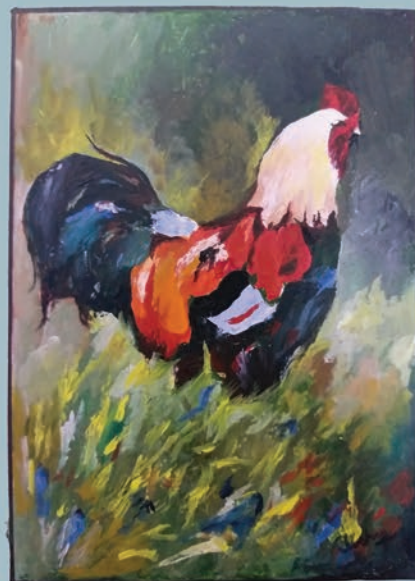
Tushar Bhattacharjee BSc 6th Semester (Physics)