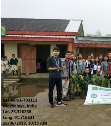
Mawkma-793111 Meghalaya, India Lat. 25.326268 Long. 91.716631 18/06/2018, 10:15 AM

Village Outreach Program was held at Mawkma Village to celebrate World Environment day by planting trees and awareness program