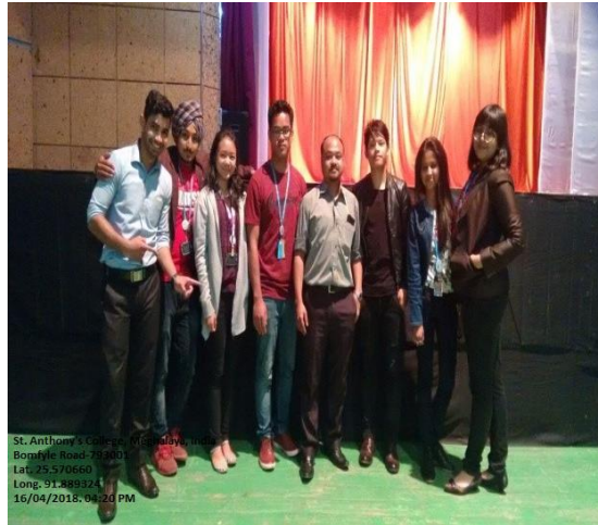
Farewell Program for the Graduated Members of the Club