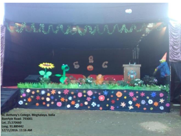
College Week Inauguration, 2016