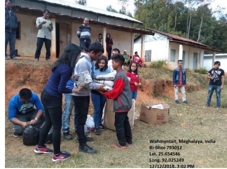
Wahmyntait, Meghalaya, India RI-Bhoi-793012 Lat. 25.654546 Long. 92.025249 12/12/2018: 3:02 PM

Village Outreach Program cum Pre-Christmas Celebration was held in Wahmyntait Village. On this day Gifts was distributed to the Villagers donated by the College Students