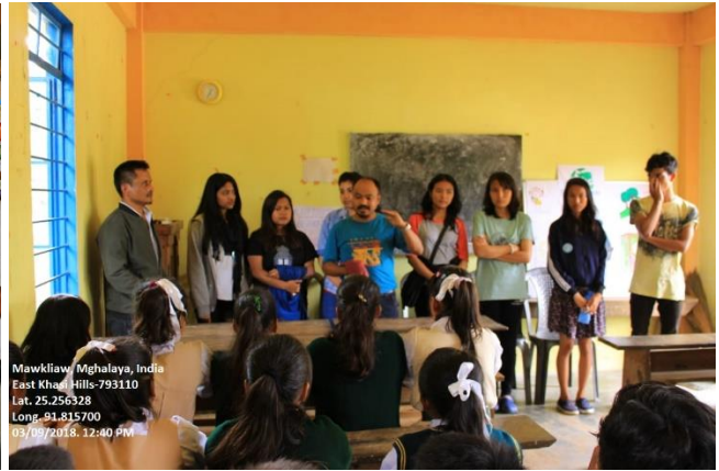
Mawkliaw, Meghalaya, India East Khasi Hills-793110 Lat. 25.256328 Long. 91.815700 03/09/2018, 12:40 PM

Village Outreach Program was held at Mawkliaw village, Seng Khasi School. On this day awareness program was held.