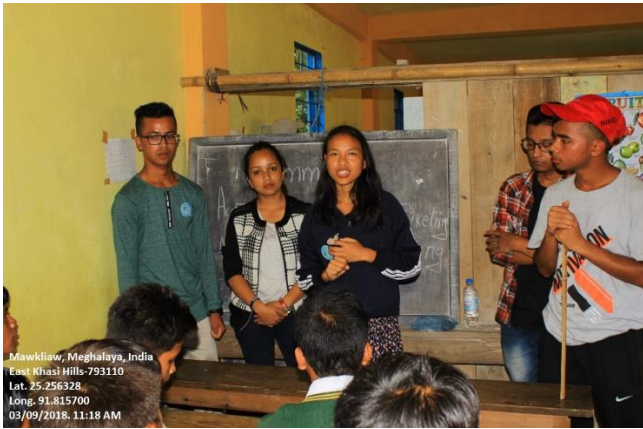
Mawkliaw, Meghalaya, India East Khasi Hills-793110 Lat. 25.256328 Long. 91.815700 03/09/2018, 11:18 AM