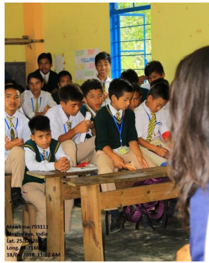
Mawkma-793111 Meghalaya, India Lat. 25.326268 Long. 91.716631 18/06/2018, 11:02 AM