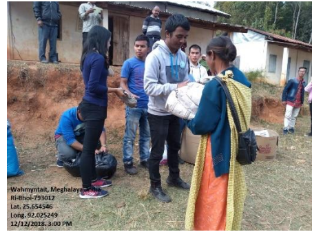
Wahmyntait, Meghalaya RI-Bhoi-793012 Lat. 25.654546 Long. 92.025249 12/12/2018: 3:00 PM

Village Outreach Program cum Pre-Christmas Celebration was held in Wahmyntait Village. On this day Gifts was distributed to the Villagers donated by the College Students