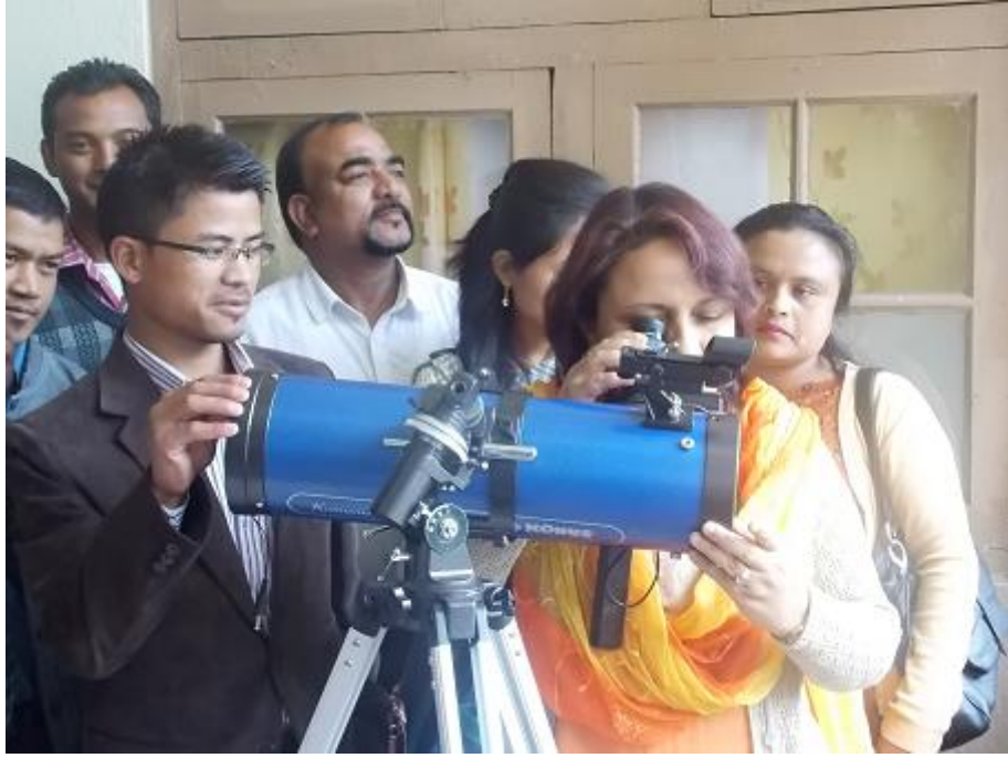
Observational and awareness drives