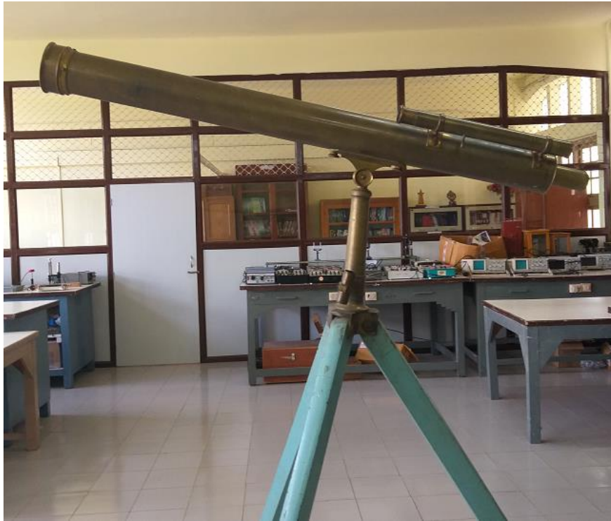
A High resolution Terrestrial Telescope