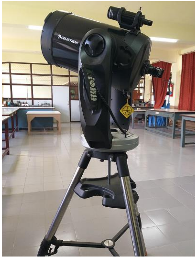
GPS enabled fully computerised Celestron CPC Series Telescope