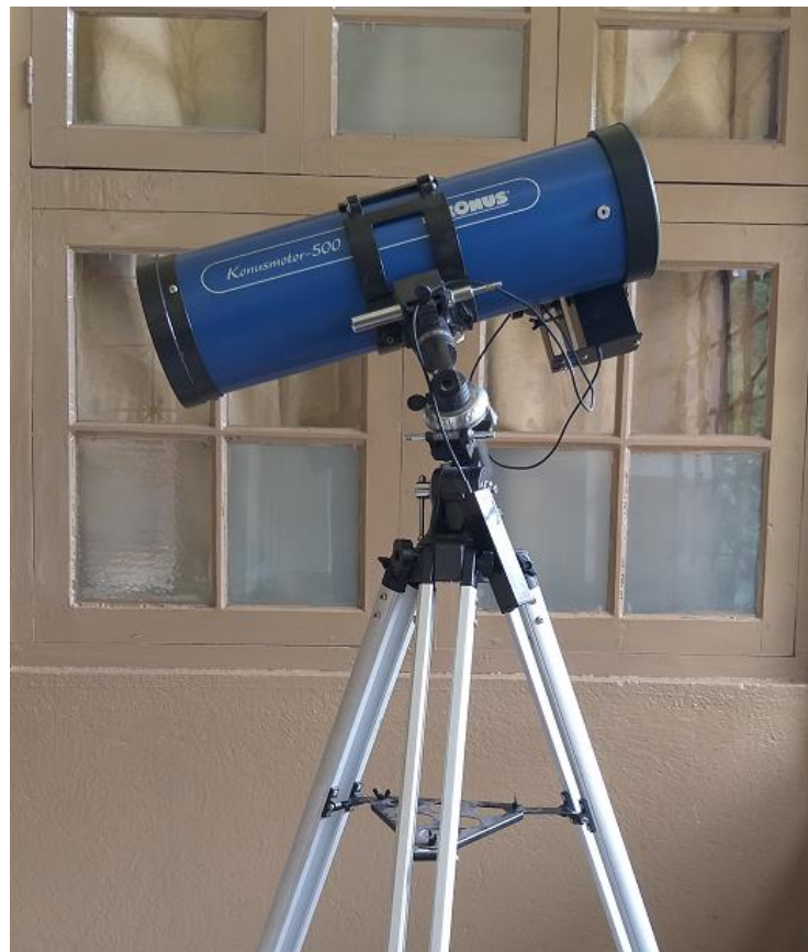
A 4.5 inch Konusmotor – 500, Newtonian Reflecting telescope