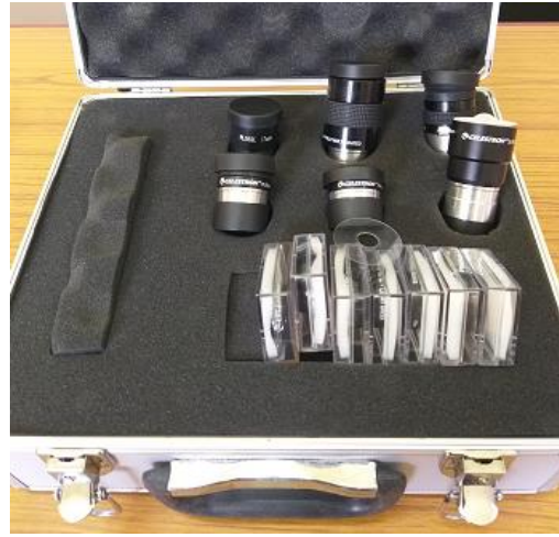
One Celestron Eyepiece and Filter kit