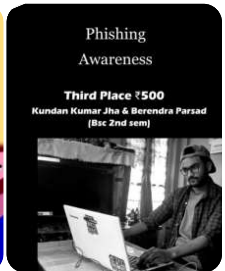
Winners of the Short Awareness Video Competition