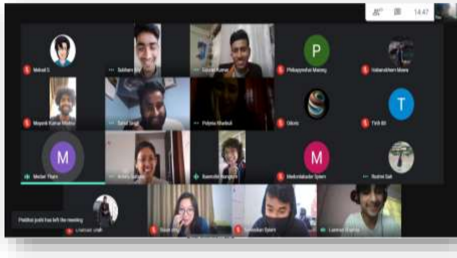
Google Meet 1