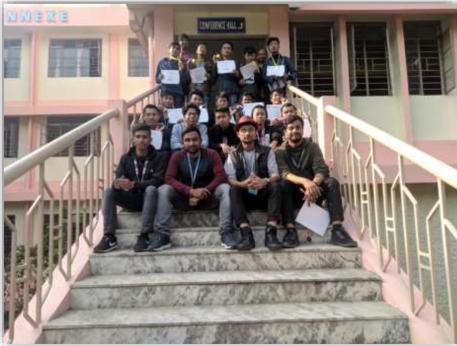
Organising Team with the Winners