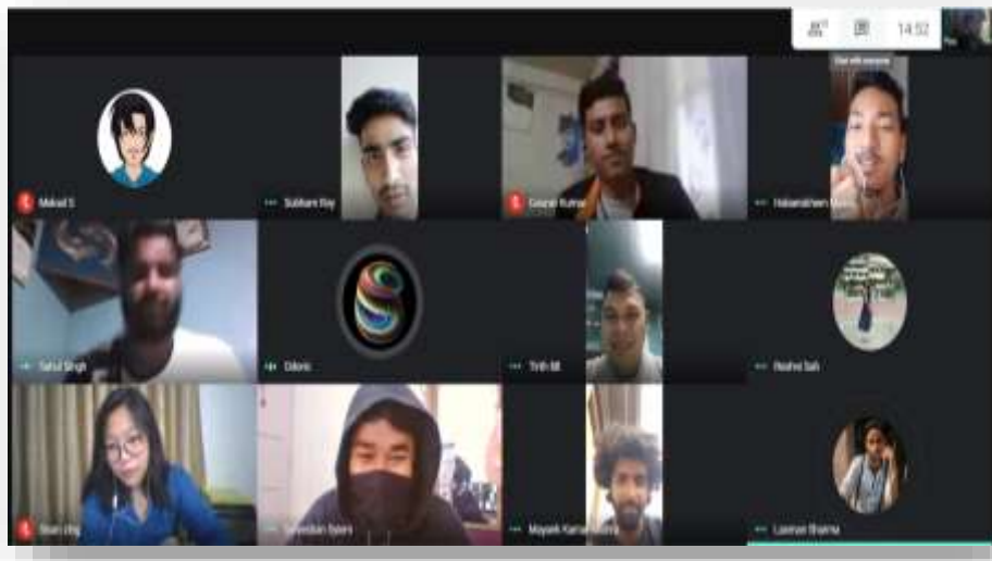
Google Meet 2